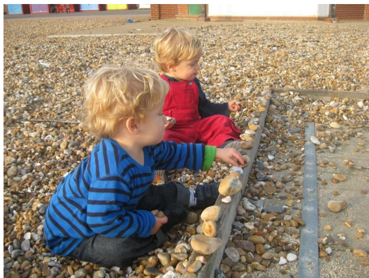
Sequencing stones at the beach

Banging rhythmically, placing systematically and following a pattern of movement indicates early Sequencing . Although the photo below is not of a Treasure Basket, the treasures of the beach give the boys a fantastic opportunity to practice their early Sequencing !