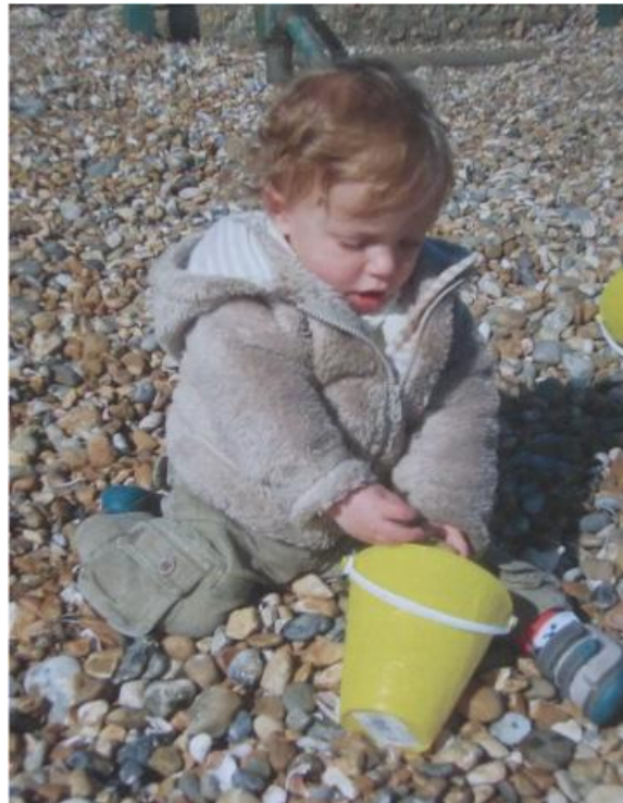
Picking up and Placing

Young children learn by doing things. But what happens when they don't just get on with it, when they don't move about and explore very much? The Waldon Approach/Functional Learning addresses the problems of these children. It's all about helping children to develop their Learning to Learn Tools. It's also a family approach, supporting the everyday life of all the family. Parents feel empowered and realise they can make a difference in their children's lives. They begin to look at play and learning with different eyes. They see that the intensive work done in the Functional Learning Lessons supports their child's learning in other settings, at home, in the garden, at the park, at the shops. All that focused unscrewing and screwing of glass jar lids suddenly translates to their little one being able to open doors at home - independently.